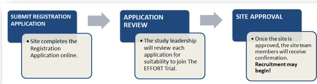
Figure 3: Overview of Site Registration

ICUs from around the world will voluntarily register their interest in participating in the EFFORT Trial. Site registration is the formal process of an interested site submitting an application to join. Once the registration application has been reviewed by the study leadership, formal approval will be granted and the site may begin study recruitment activities. The figure below outlines this process.